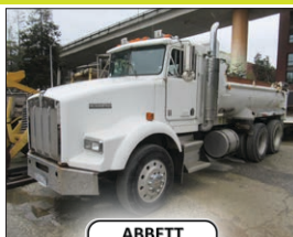
ABBETT ELECTRIC CORPORATION