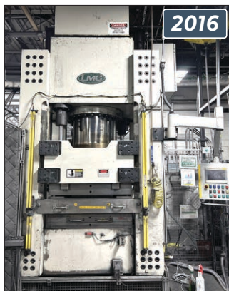
LMG 1000-Ton Hydraulic Press