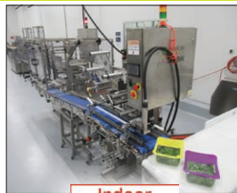
Indoor Vertical Farming Facility