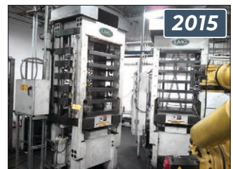
LMG 300-Ton Press System

Visit linkauctions.com for Terms of Sale, Photos & Machine Information