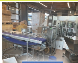
Food & Beverage Packaging Equipment Expo